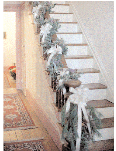
Decorated homes from last years tour.

Thanks to the overwhelming response from our neighborhood, this year's cookie tour looks to be the biggest and best ever. Twenty homes and one garden will be dressed up and on display for the Union Square Holiday Cookie Tour.